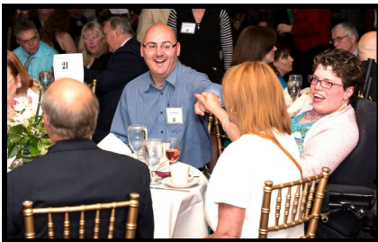
Happy at this table!